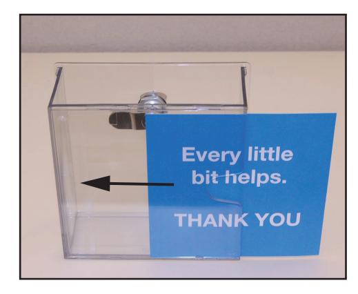
(6) Insert graphic into side opening in front panel of PART A .