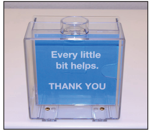
(8) Slide PART A back into PART B.