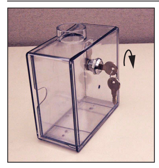
1) Turn key clockwise to open box.