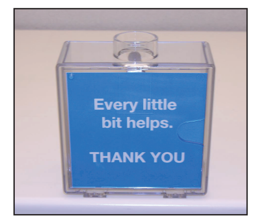
(9) Turn key counter-clockwise to lock Coin Box. Remove keys and keep in a safe place.