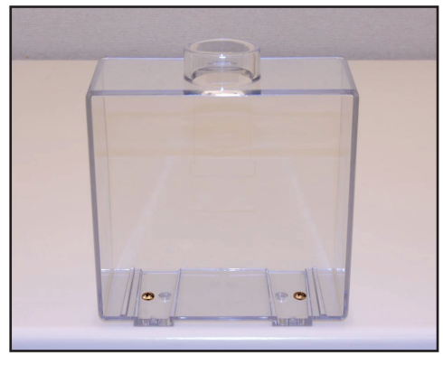
(5) Tighten self-tapping screws into countertop.